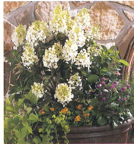
Baby Lace™ hydrangea Hydrangea paniculata