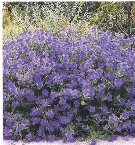
First Editions® Sapphire Surf™ bluebeard Caryopteris x clandonensis 'Blauer Splat'