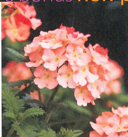
Superbena® Royale Peachy Keen verbena Verbena hybrid