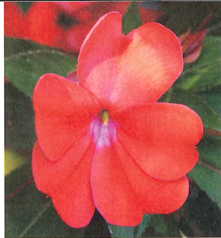
SunPatiens® Spreading Corona impatiens Impatiens hybrid