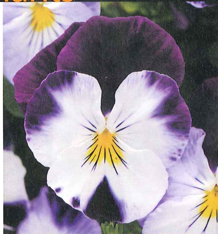
Cool Wave™ Violet Wing pansy Viola hybrid