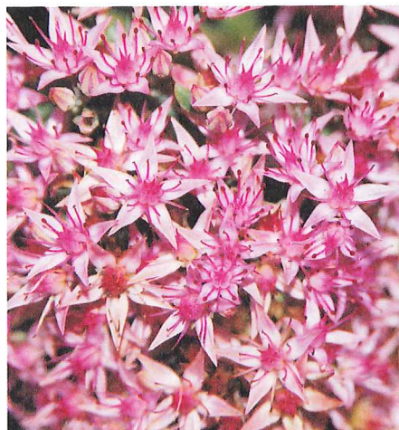
'Pure Joy' sedum Sedum hybrid